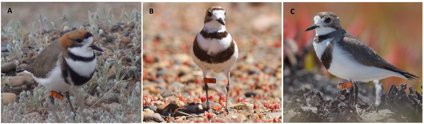
Figure 2. Two-banded Plovers ( Charadrius falklandicus ) in breeding plumage resighted in 2017 at Chubut province, Patagonia, Argentina. A) 01X at Playa Paraná. B) 05X at Playa Paraná. C) 23X at Playas Blancas.