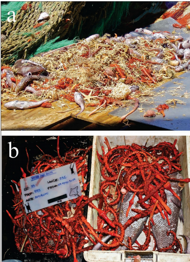
Figure 2. View of the catches with Pennatulacea as an important component. a. Site 3; b. Site 8.

The sea anemones were identified as Hormathia pectinata , a species already reported for Burdwood Bank by Riemann-Zürneck (1986). The identification of this well-known sea anemone was performed by examination of the external anatomy: the colour is white or light orange in living specimens (Fig. 3) while preserved specimens became whitish. The actinopharynx is brown to brown-red; column tough divided into scapus and scapulus. Scapus with brown cuticle, sometimes partially lost. Scapulus with tubercles with brown chitinous cuticle and with longitudinal ridges ending in larger coronal tubercles. Mouth opening prominent with thick lips. Numerous brown-red tentacles. The examined specimens fit very well the descriptions provided by Riemann-Zürneck (1973) and Haussermann and Försterra (2009).